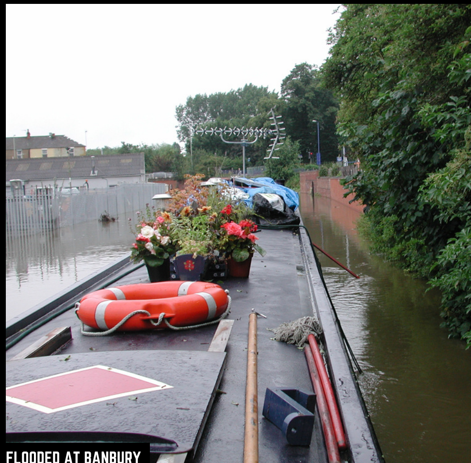
FLOODED AT BANBURY