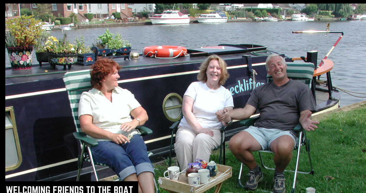
WELCOMING FRIENDS TO THE BOAT