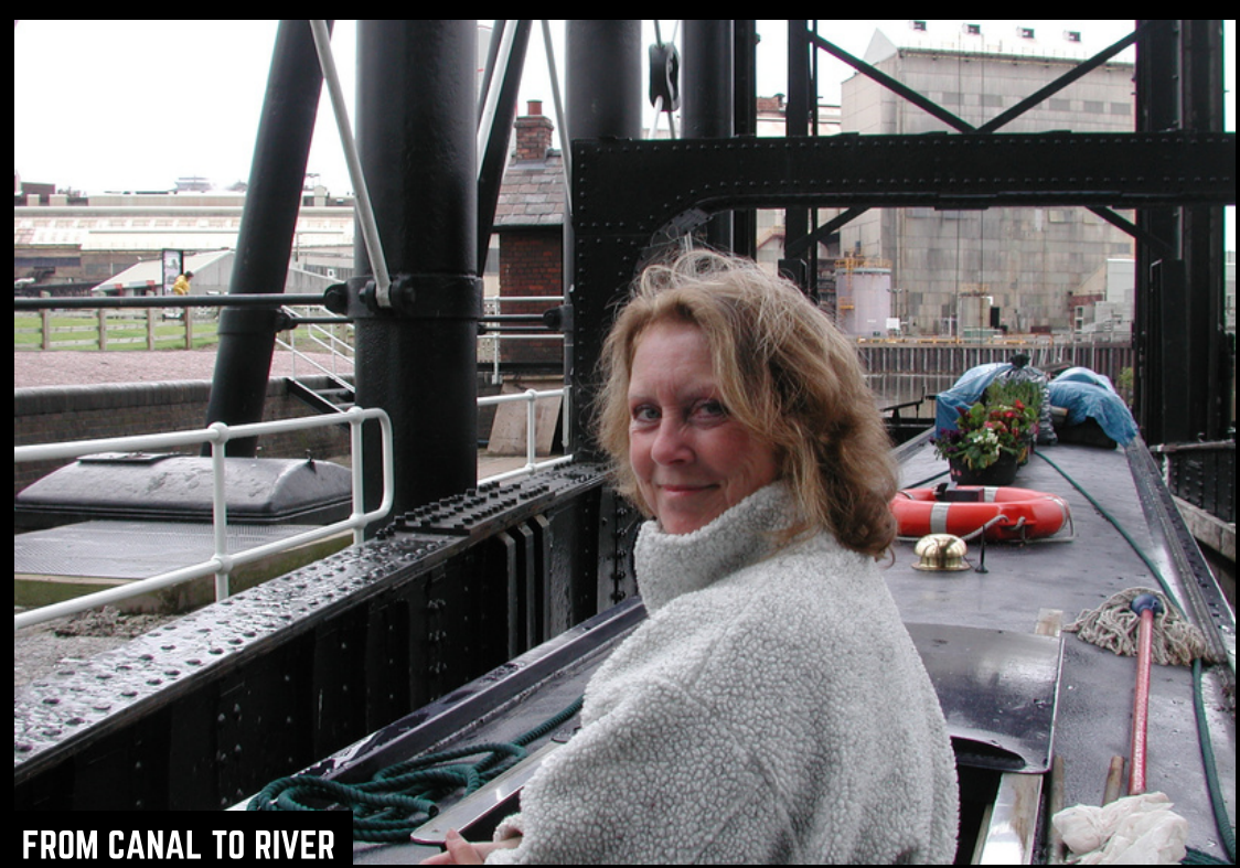
FROM CANAL TO RIVER