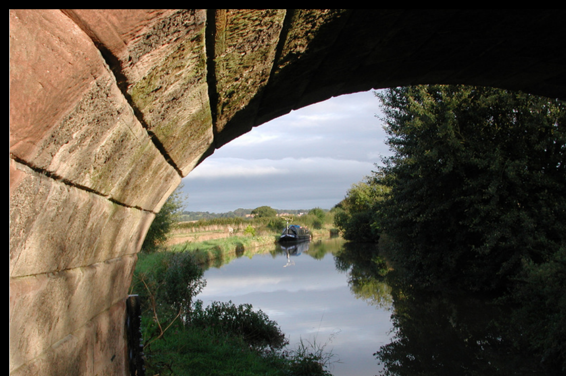
VIEW FROM (UNDER) THE BRIDGE, SHROPSHIRE UNION CANAL