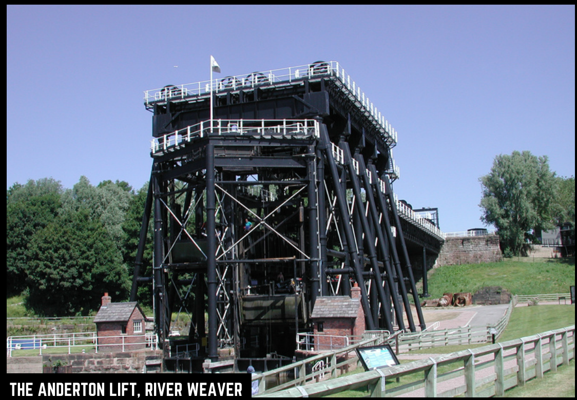
THE ANDERTON LIFT, RIVER WEAVER