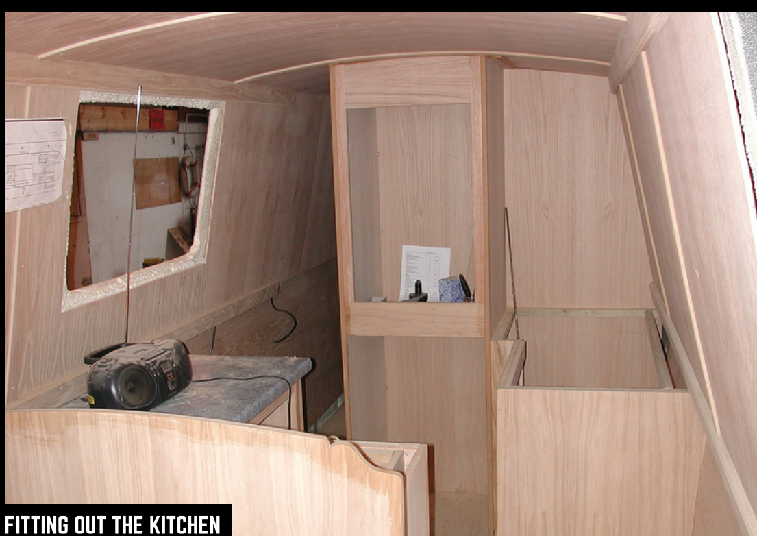
FITTING OUT THE KITCHEN