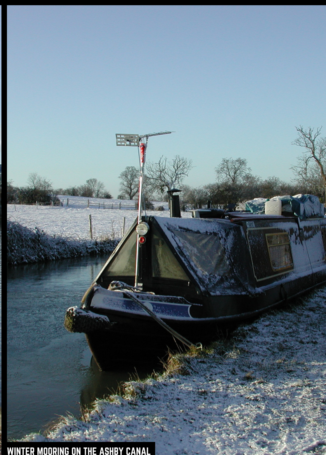
WINTER MOORING ON THE ASHBY CANAL