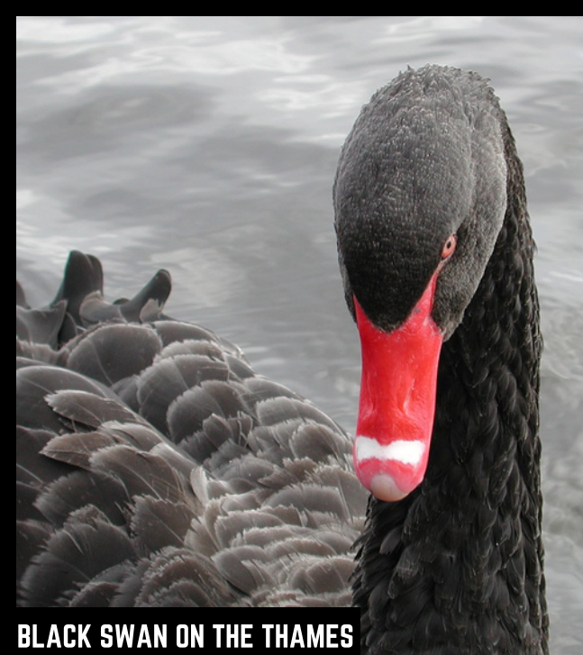
BLACK SWAN ON THE THAMES