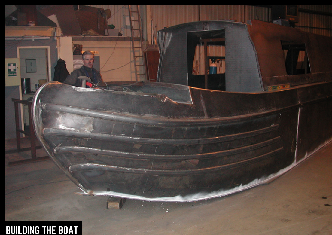
BUILDING THE BOAT