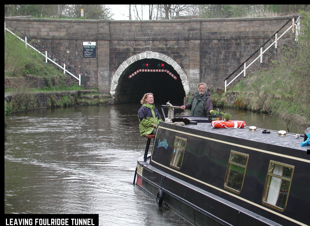
LEAVING FOULRIDGE TUNNEL