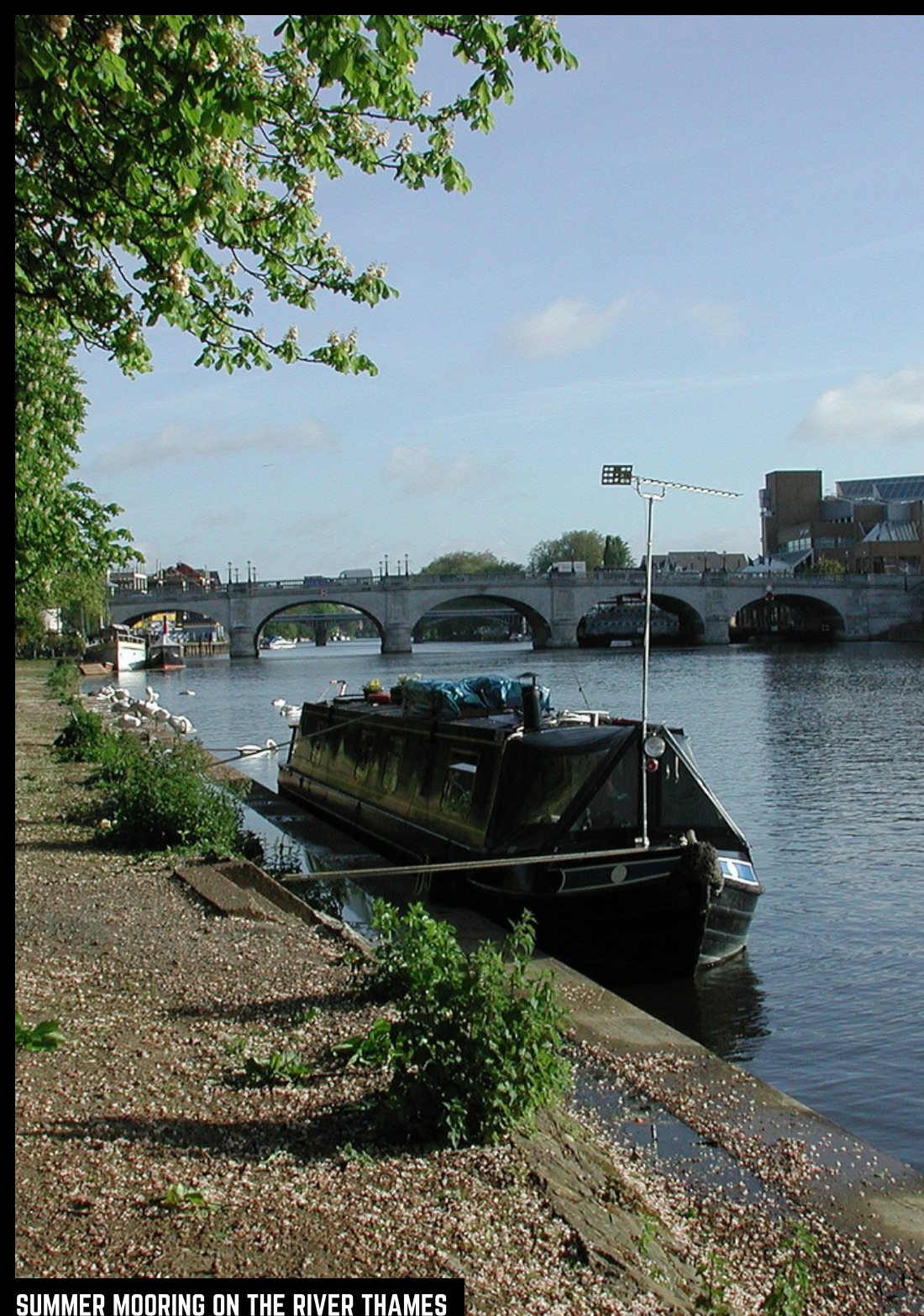
SUMMER MOORING ON THE RIVER THAMES