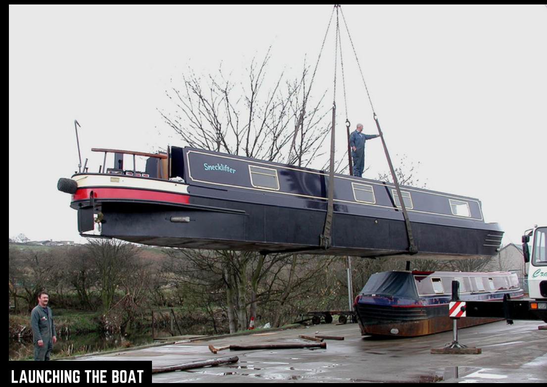
LAUNCHING THE BOAT