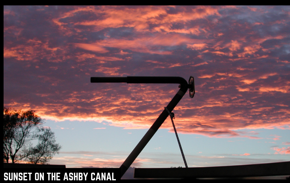
SUNSET ON THE ASHBY CANAL